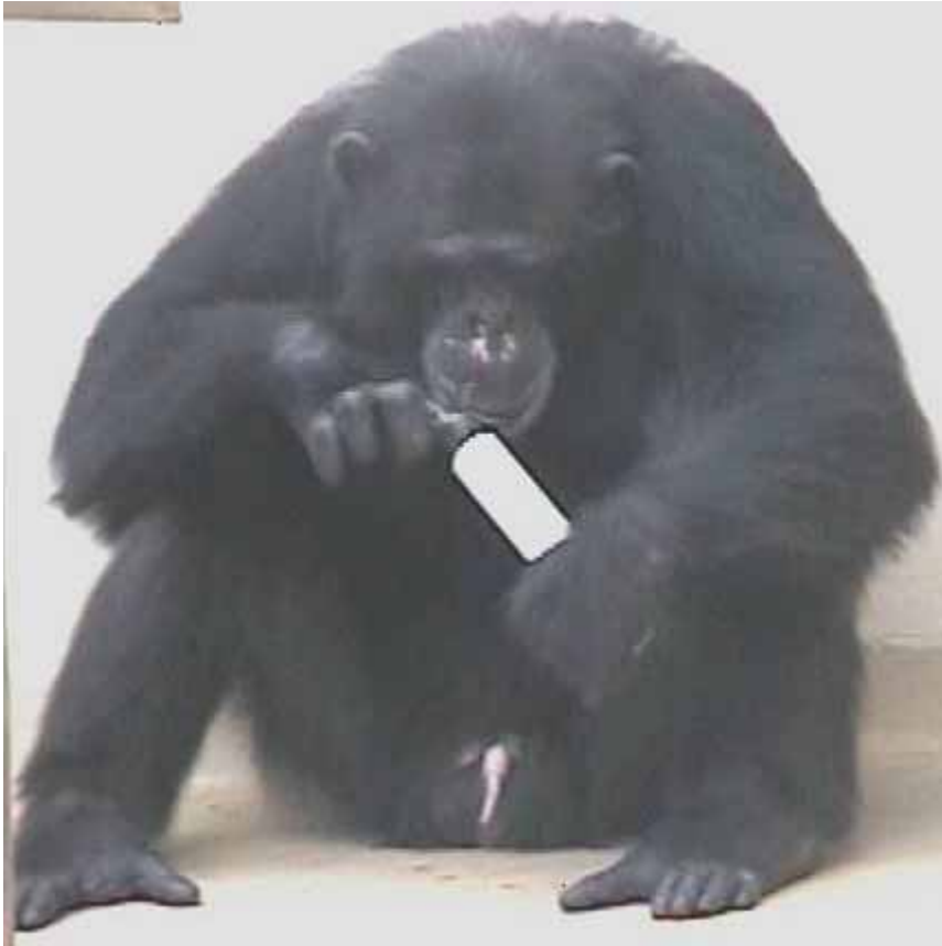
Figure 1. Chimpanzee doing the tube task.

rotation of the tube, a change in bout was only recorded when the tube was physically rotated and not when the subject simply rotated their wrist in order to access the peanut butter in the tube. At the end of testing, the total number of left-and right-handed bouts was summed across the eight test sessions.